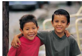
Teachers make a difference in the lives of children every day

Teachers develop a curriculum based on school, district and state standards. In addition, teachers assess student's progress. Besides the